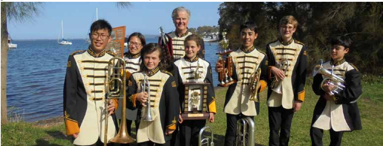
Winners at Rathmines by the shores of Lake Macquarie.